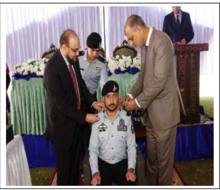
<u>Certificates distribution and Badge Pinning ceremony after</u> <u>completion of Basic Probationer Training Course of SIs at Academy</u>