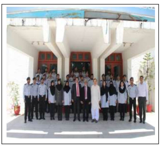
Professional Development Course by ICIT Group II