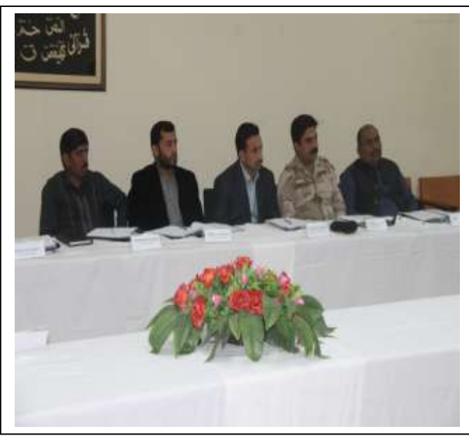
Digital Forensic Course at FIA Academy