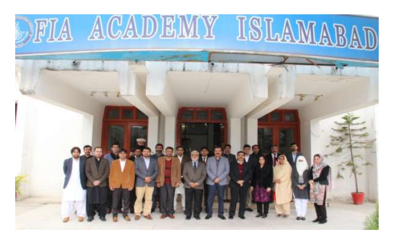
Participants of the course on White Collar Crimes