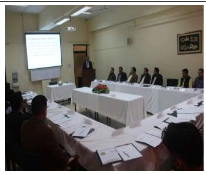
Human Smuggling and Trafficking Course by UNODC