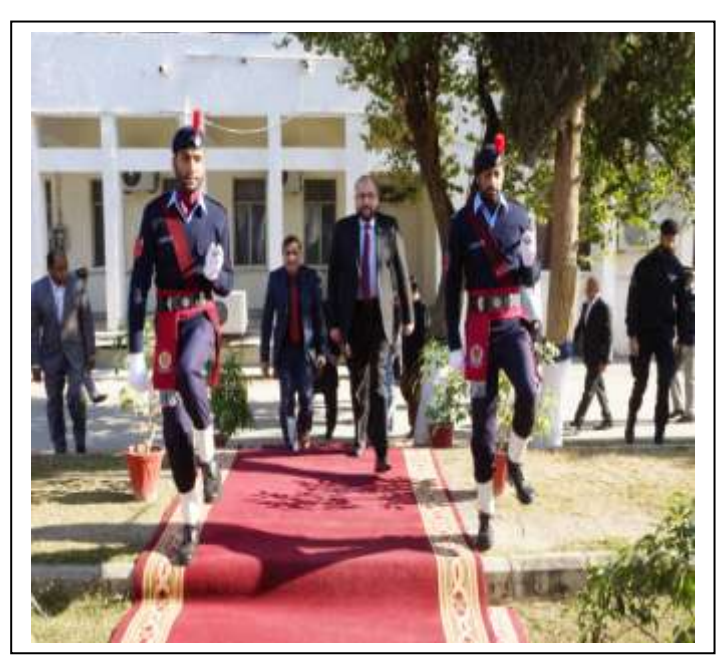
Passing out ceremony