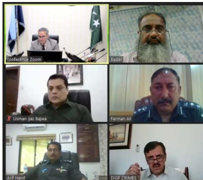
Online Meeting with Provincial Police