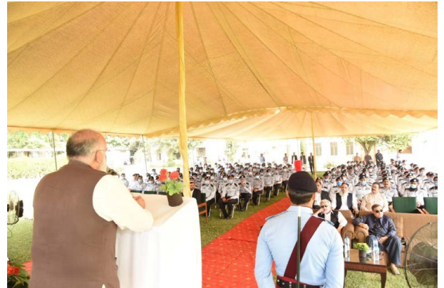
DG FIA addressing to Graduates of Lower School Course in collaboration with UNODC Pakistan