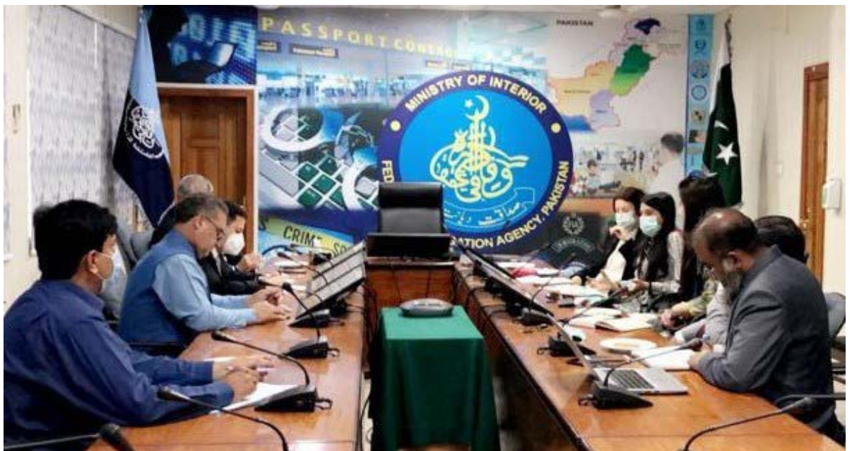
FIA meeting with UNODC & IOM

Research and Analysis Center FIA HQ Islamabad