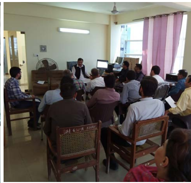
Session in AHTC Islamabad Zone