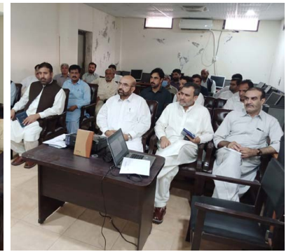
Session in Progress in KP Zone