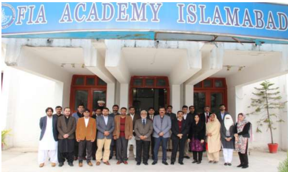
Participants of the course on White Collar Crimes