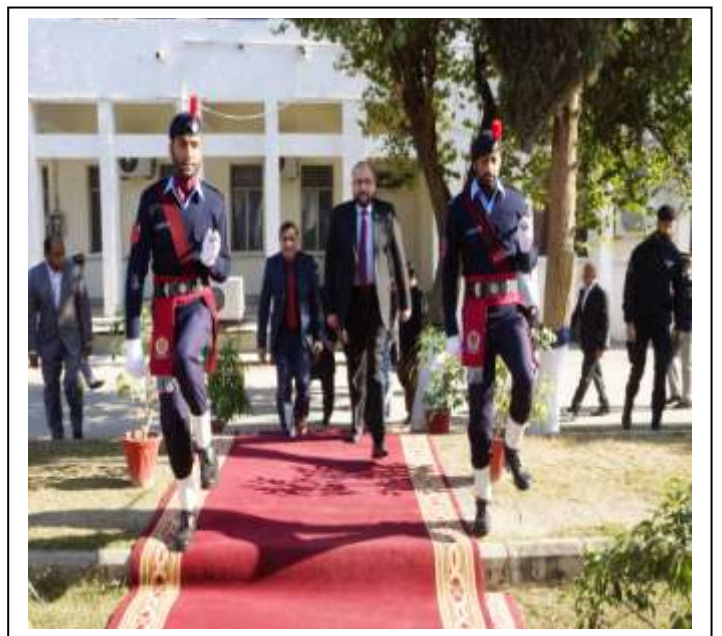
Passing out ceremony