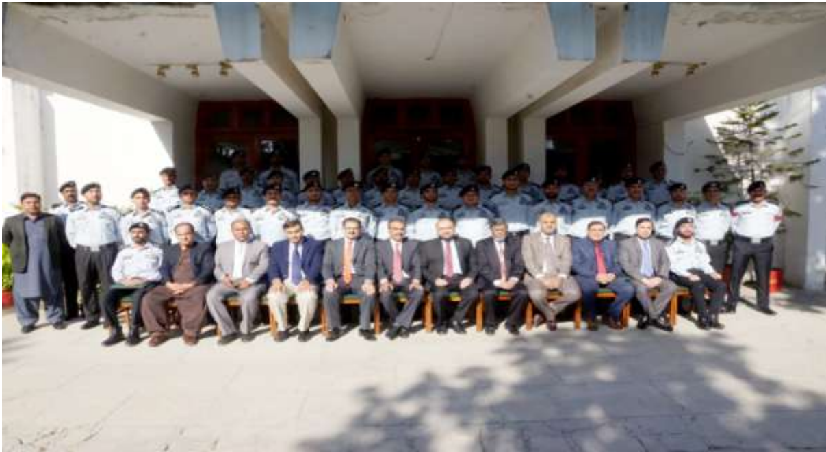
Group photo of passed-out Sub-Inspectors at FIA Academy