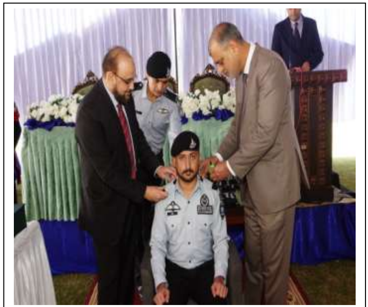
Certificates distribution and Badge Pinning ceremony after completion of Basic Probationer Training Course of SIs at Academy