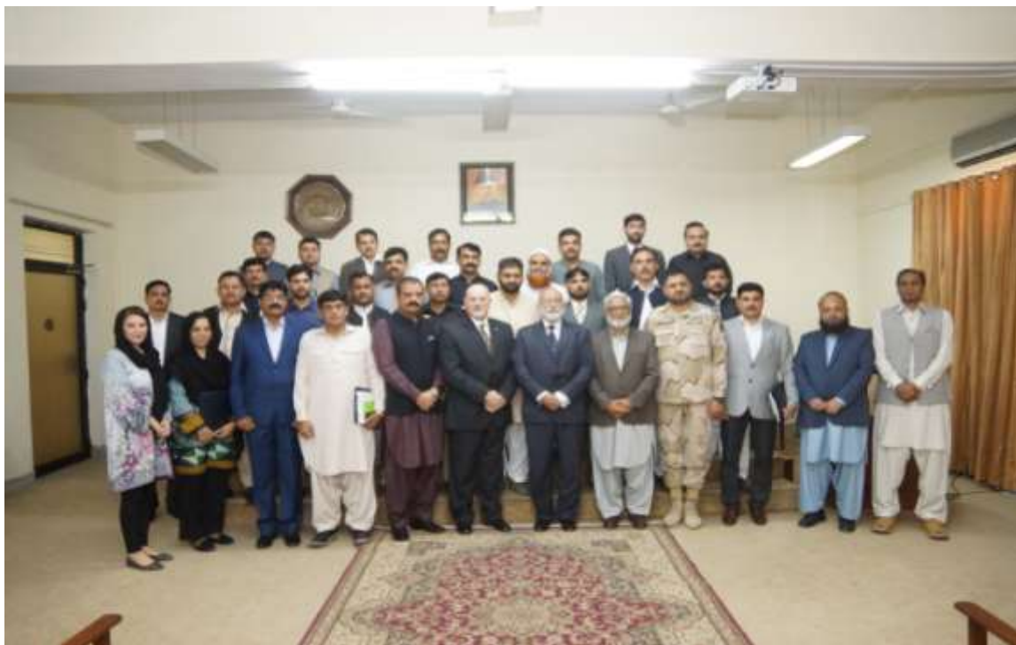
Participants of Anti corruption course